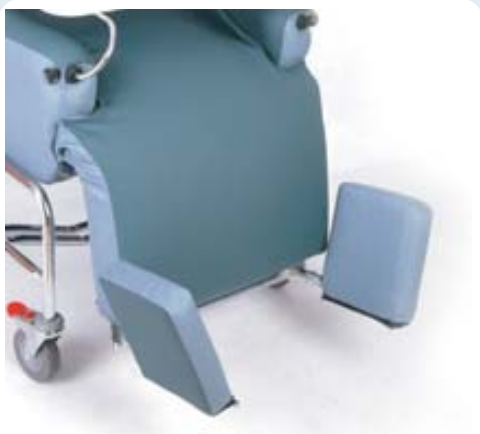
The Flip-Open Footrest

ABOVE: The XSENSOR Pressure Mapping diagram illustrates the effectiveness of the Air Comfort Seating System™ dramatically reducing seating pressure. Dark blue - lowest pressure. Red - highest pressure.